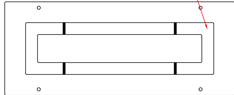
INVISION 12 X 4

Area between center section and surrounding face can vary between sizes